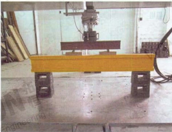
a) Test arrangement for shear resistance